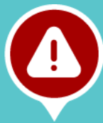
User Added Danger Marker