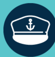
Friends in Your Fleet